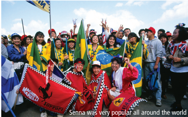
Senna was very popular all around the world