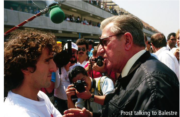
Prost talking to Balestre

Senna was very angry. Other people sometimes left the track in a race and joined it in a different place. Balestre didn't disqualify them.