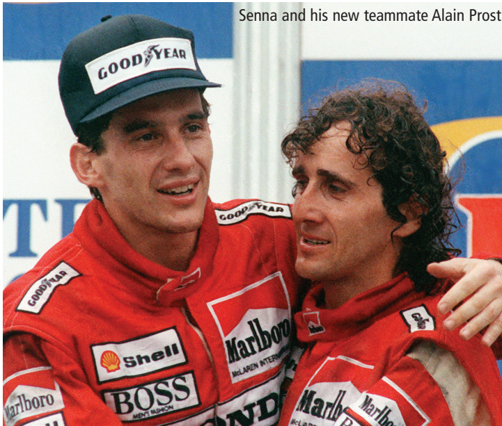
Senna and his new teammate Alain Prost

At first, Prost and Senna worked quite well as teammates. But they were very different. Prost thought carefully about a race. He did exactly as much as he needed to. If he could win a championship with a third place in the race, he came third.