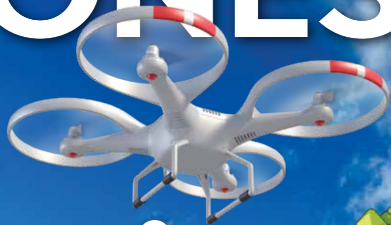
Illustration reproduced with kind permission from Science World Magazine, Scholastic Inc

Drones are going to change our lives forever – in some ways for better – and in other ways for worse!